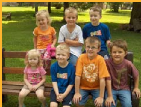
Kids from different families making friends